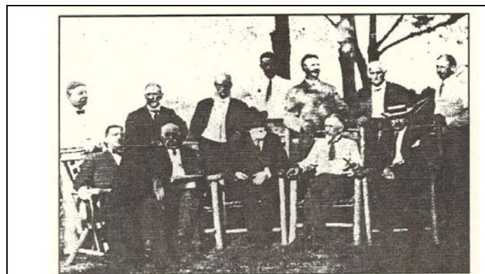
Members of the Haymarket Agricultural Club. Picture taken at "Waverly" in 1905.

How oft we've met in days of yore, Around our festive board; And emptied bottles by the score, Till wine like water poured! And how we used to pledge our host In good old Mill Park wine, With gibe and jest, with het and boast, In days of Auld Lange Syne! 26